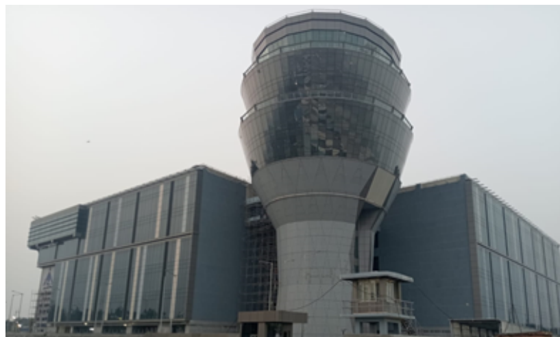
Air Traffic Control Tower & Technical Building Kolkata Airport