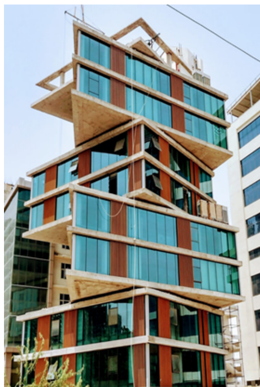
Sampark Foundation, Noida