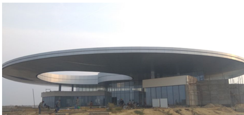
Grameen Bhawan, Central Vista, New Delhi